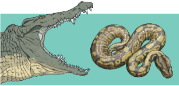
Reptiles: cold-blooded, have scales, lay eggs.