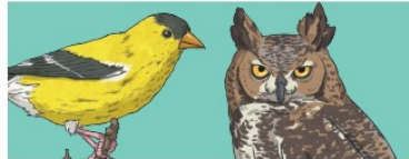
Birds: warm-blooded, have beaks, feathers and wings, lay eggs.