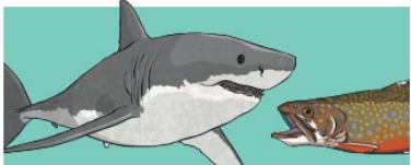
Fish: cold-blooded, live in water, most lay eggs.